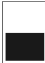
1/2 HORIZONTAL 4.875"W X 3.687"H