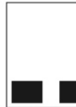
1/8 HORIZONTAL 2.375"W X 1.781"H TILE 1.558"W X 1.781"H