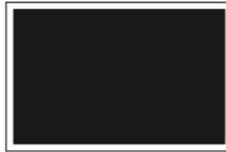
DPS 10.25"W X 7.875"H

NO BLEED (EXCEPT FOR THE BACK COVER SPONSOR AD: 5.5 X 8.5" + BLEED)