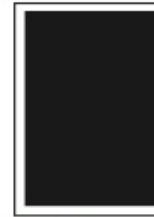
FULL PAGE 4.875"W X 7.875"H