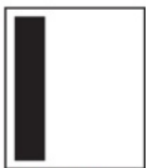
1/4 VERTICAL 2.47"W X 12.38"H