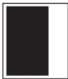
3/4 VERTICAL 7.66"W X 12.38"H