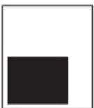
3/8 HORIZONTAL 7.66"W X 6.12"H