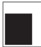
JUNIOR PAGE 7.66"W X 9.25"H