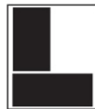
1/3 PAGE (V)5.06"W X 8.21"H (H)10.25"W X 4.04"H