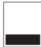
1/4 H / BANNER 10.25 "W X 3"H