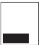
3/16 7.66"W X 3"H