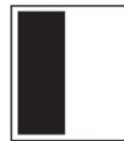
1/2 VERTICAL 5.06"W X 12.38"H