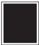
FULL PAGE 10.25"W X 12.5"H