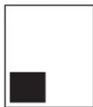
1/6 5.06"W X 4.04"H