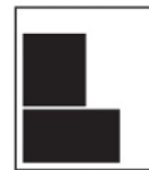
1/4 PAGE (SQ)5.06"W X 6.12"H (L)7.66"W X 4.04"H