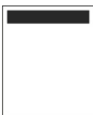
POP UP 10.25"W X 1.5"H